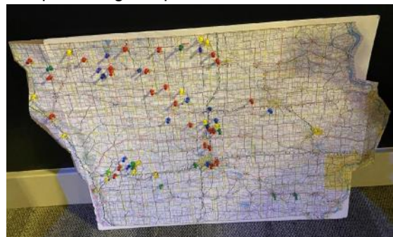
Locations of 66 LCMC churches in Iowa

will be meeting with the board four or five times throughout the year and will attend their Annual meeting and Leadership meetings as part of his duties as well.