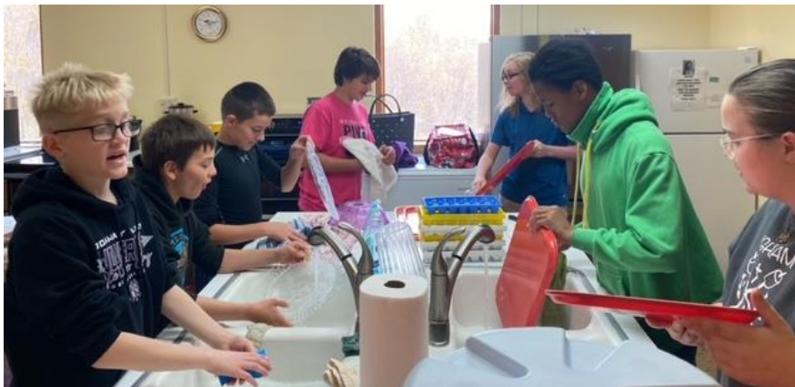
Confirmation students wash dishes after the breakfast fundraiser that raised money for their Recharge Weekend in November.